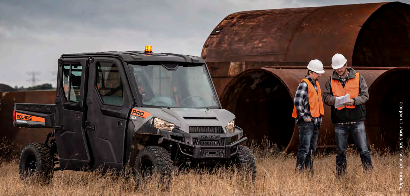
*Optional accessories shown on vehicle